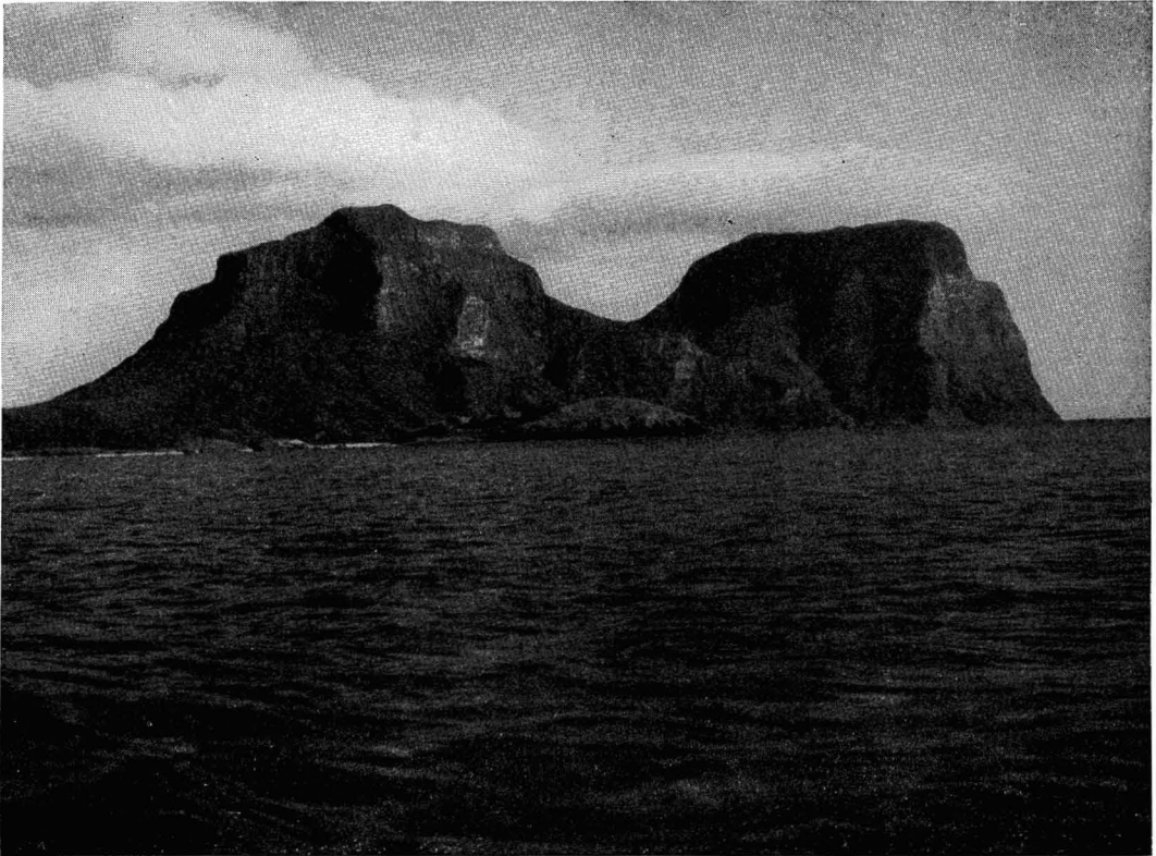
FIG. 1. Lord Howe Island. The mountainous southern part of the island as seen from northwest. At right Mt. Gower, at left Mt. Lidgbird. In foreground, Rabbit Island. The slopes of both mountains are densely afforested.

At the head of the bay grew a fine long grass, and the whole island appeared to be covered with trees, among which mangroves and coconuts were conspicuous. There was a very thick undergrowth of a vine resembling ratten, which crept along the ground and greatly impeded us in the pursuit of birds. The surface of the island in centre was composed of sea sand, mixed with marine shells, and most parts were covered with trees. The island seemed to be about 16 miles long. Great numbers of gannets, very large and fat, were about, showing less fear than geese in a farmyard. We found many nests in the long grass at the head of the bay. On entering the woods I was surprised to see large fat pigeons of the same plumage and shape as those in Europe. They were so tame as to be knocked down with little trouble. Partridges, likewise, in great numbers ran along the ground. Several of these I