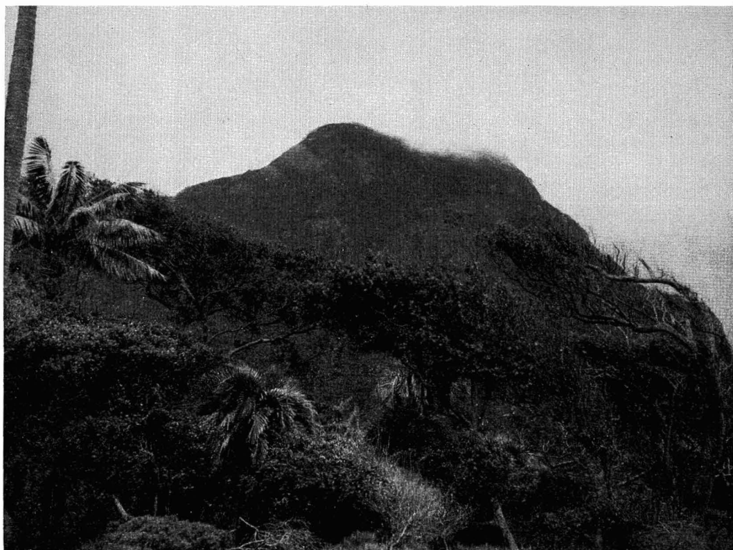
FIG. 3. Slopes of Mt. Lidgbird, showing the type of vegetation in the middle zone, about 800 feet above sea level.

Regular connection of Lord Howe Island with the mainland is maintained now only by flying boats (run by Ansett Airways), flying from Sydney one or two times a week. The flight takes about three and a half hours; in bad weather the flight is usually postponed till the weather improves. The flying boats land in the lagoon near a jetty, all passengers and their goods being transported to the jetty by motorboats. Thirty-